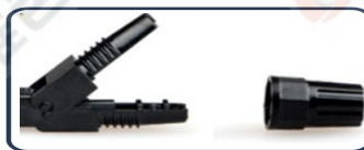
Threaded design, easy to open