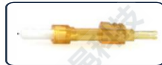
V-GROOVE, Precise docking