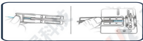
Precise measuring of fiber length