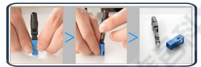
Can be used repeatedly