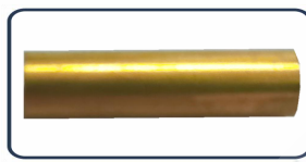
Copper tube,Strengthen the tension