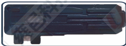
One tool,two functions