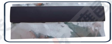
Silicone and tin foil double protection, IP68 waterproof level