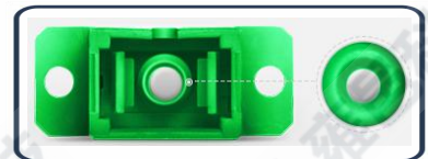
High precision ceramic sleeve