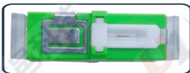
Traceable buckle for easy identification