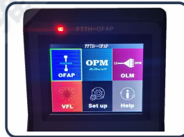
Color multi-function display screen