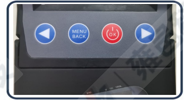
Easy to operate