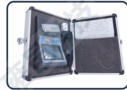
A small box, all accessories