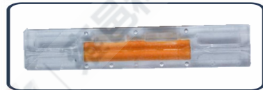
Transparent material.the fiber can be seen while connecting.