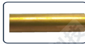
Copper tube,Strengthen the tension