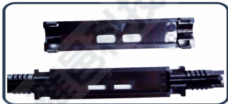
Snap - button crimping, firm and reliable