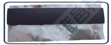
Silicone and tin foil double protection, IP68 waterproof