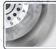
High quality tungsten steel