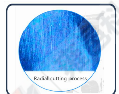
Radial cutting process