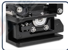
Polishing and cleaving in 1 machine.